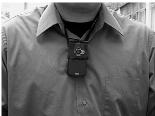
Figure 2 Image of the mobile phone. An image of participant wearing camera-embedded used in study.

Server repository. Images were captured every 10s, allowing near-complete documentation of foods and beverages consumed throughout the target period covered in the 24-h period and without minimal user intervention. Industry-standard encrypted transmission was used for web access to the repository and transmission of images between mobile phones and data storage servers. Images were filtered to