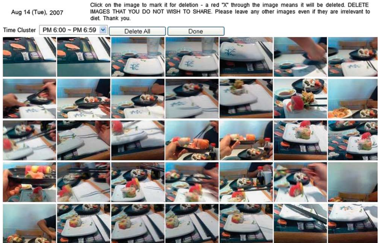
Figure 4 Example of presentation of food images for subject review. A web-based ImageViewer was used by participants to access images after filtering; participants could then delete images deemed private from the public record.

and not crosslinked to those with personal data. For this, we developed levels of protection that involve participation and approval of the informed participant at each level. The participants were asked whether they wish to share any, some or all images with study investigators. Any images marked as protected (for example, not shared) were permanently deleted from the data storage server when the participant logged out of Image-DietDay. Image counts deletion was maintained, along with the timestamps and sequence position of the deleted images to assist in understanding deletion patterns and intent. This was to address concerns regarding sanitation of food consumption images. 'Shared' images were to be accessible to the investigators and their designees, who sign confidentiality agreements, via password-protected interfaces. Images that were never viewed by the participant (such as when the system determines them to be unclear and therefore unhelpful to display) were deleted. To further protect the privacy of participants, the image repository did not store personally identifiable information. This study received Institutional Review Board approval for a three-step process: (1) automated image capture from the camera phone, (2) automatic, encrypted upload of images to a secure repository and removal from the device, (3) a private web portal for each participant that allowed them to review their images and