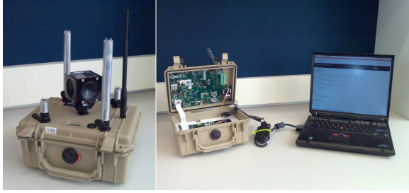
Figure 1. Left, the Acoustic Ensbox and right, the Acoustic Laptop using the same sensor array. The array is integrated into a ‘Pelican’ box which houses the battery compartment and optionally the Ensbox platform.

USB, broad availability and a large collection of packaged, pre-compiled software. This processing power allows on-line evaluation of intensive algorithms, enabling interactive experimentation and real-time analysis. However, the Acoustic Laptop is more cumbersome to deploy, and much less energy-efficient and weather-resistant. A laptop-based system is unlikely to last more than about 3 hours on batteries, and the keyboard, fans and vents are more likely sources of mechanical failure in harsh conditions. As such it is suitable only for development, evaluation, system planning and brief pilot deployments—but the similarity of the two systems minimizes the effort required to switch back to the ENSBox for longer deployments. The Acoustic Laptop is not intended to replace the Acoustic ENSBox, but compliment it by providing an even less constrained and readily available rapid prototyping environment. The relative ease of adoption for researchers allows exploratory investigation and analysis of distributed sensing systems without requiring a full adoption of a specific embedded platform. Because of the framework in which the software is developed, transferring to the embedded platform is a straightforward process.