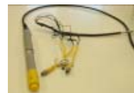
Relative Humidity and Temperature Sensor Probe