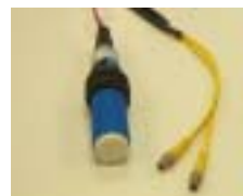
Ultrasonic Position Sensor