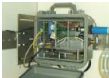
Electronic components and environmentally sealed package