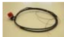
Photosynthetically Active Radiation Sensor