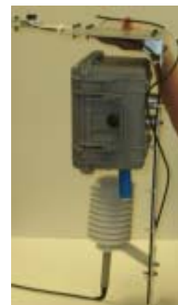
View of complete MultiSensor Module