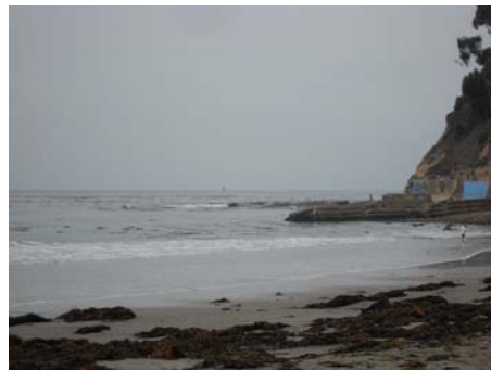
Site where water and sediment samples are collected for water quality analysis.

The EcoPDA will also be evaluated as a lab instrument. This will also be done with a comparison to recording data by paper. The benefit of this evaluation will potentially solve the problem of the limited use of computers in a lab setting with many various projects.